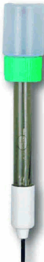
pH electroode ( optional )